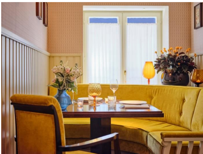
Salon Colette 150€ incl. VAT / 125€ excl. VAT