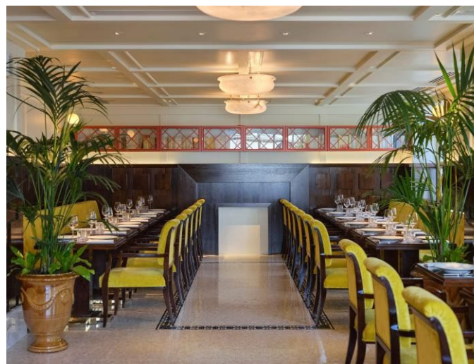
Bibliothèque 500€ incl. VAT / 416,67€ excl. VAT