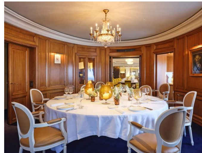
Salon Goncourt 500€ incl. VAT / 416,67€ excl. VAT