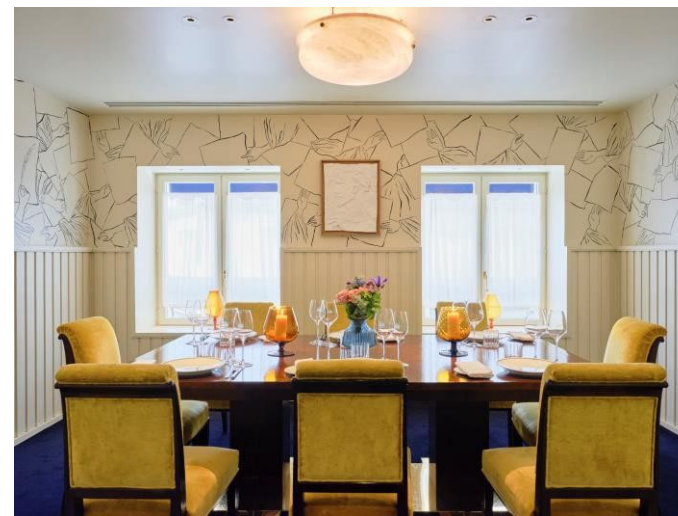
Salon Renaudot 300€ incl. VAT / 250€ excl. VAT