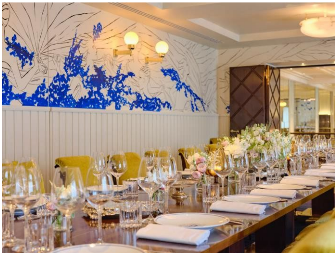
Salon Proust 500€ incl. VAT / 416,67€ excl. VAT