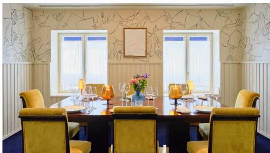
RENAUDOT DINING ROOM from 300€