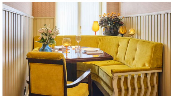
COLETTE DINING ROOM from 150€