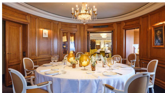
GONCOURT DINING ROOM from 500€