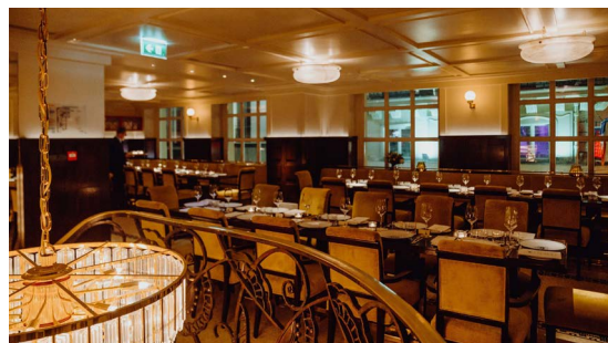
BIBLIOTHÈQUE SPACE from 500€