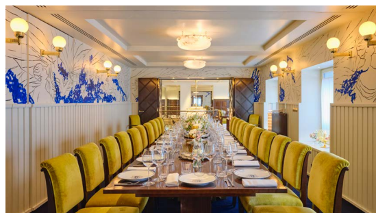
PROUST DINING ROOM from 500€